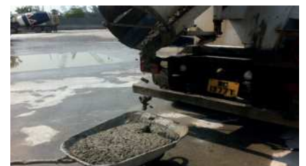
3. Concrete mixed in