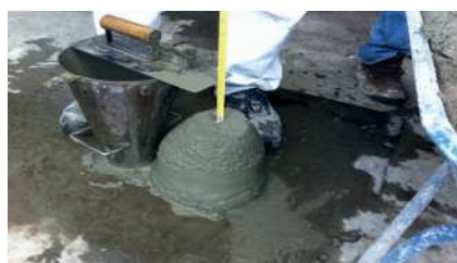
5. Measuring slump test result