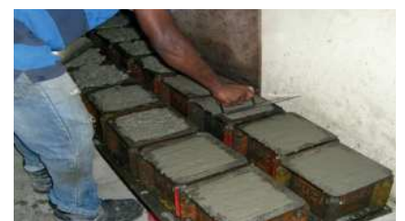
6. Preparation of concrete cube