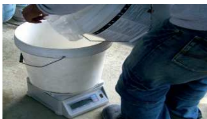
1. Weighing of Formdex Admix