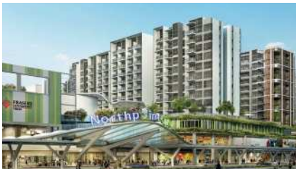
North Point City - Singapore