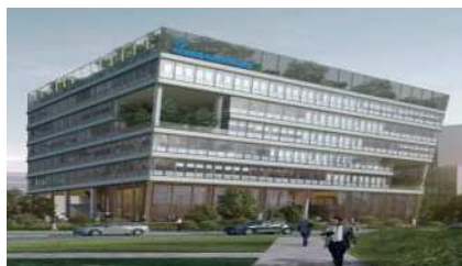
Rohde & Schwarz Building - Singapore