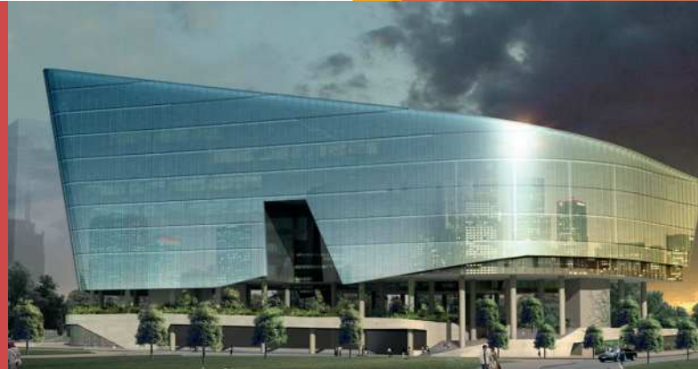
SANDCRAWLER BUILDING - SINGAPORE

FORMDEX ADMIX IS A CHEMICAL ADMIXTURE IN POWDERED FORM USED IN THE WATERPROOFING AND PROTECTION OF CONCRETE STRUCTURES. FORMDEX ADMIX CONSISTS OF PORTLAND CEMENT, FINE TREATED SILICA SAND AND VARIOUS ACTIVE PROPRIETARY CHEMICALS.