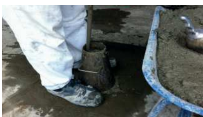
4. Compacting concrete for slump test