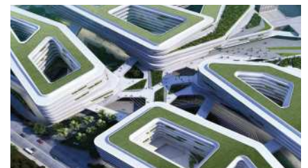
Singapore University of Technology & Design - Singapore