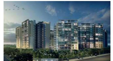
Watercolors - Singapore