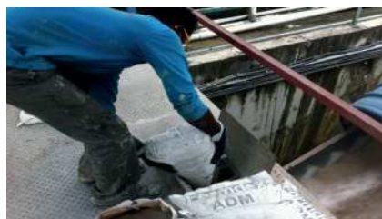
2. Dosing onto conveyor belt