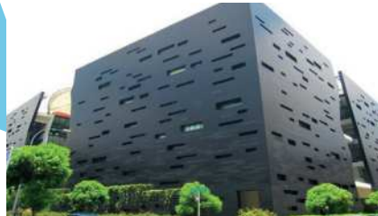
La Salle School - Singapore