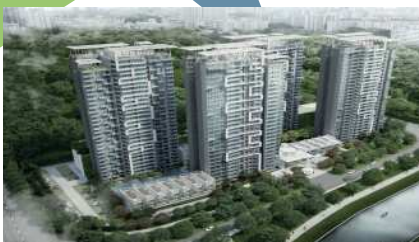
Eight Riversuites - Singapore