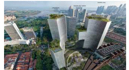
DUO Residences - Singapore