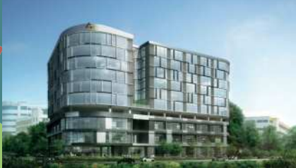
AZ Building - Singapore