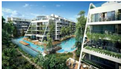
The Nautical - Singapore